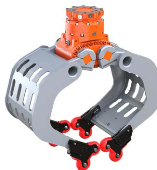
optional 4-Grip gripping device, here mounted to a D09HPX